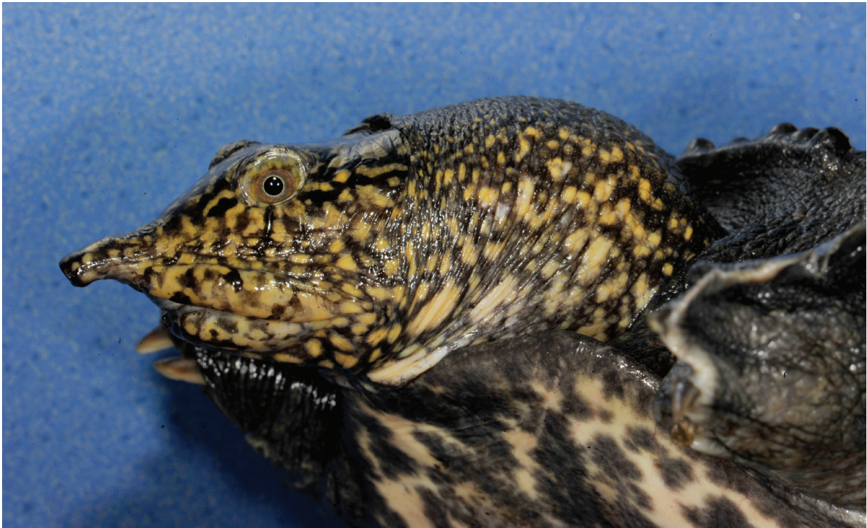
Figure 9. Lateral shot of the head of a living A. o. jongli ssp. nov. showing the ochre-coloured eyes and the shape of the head.