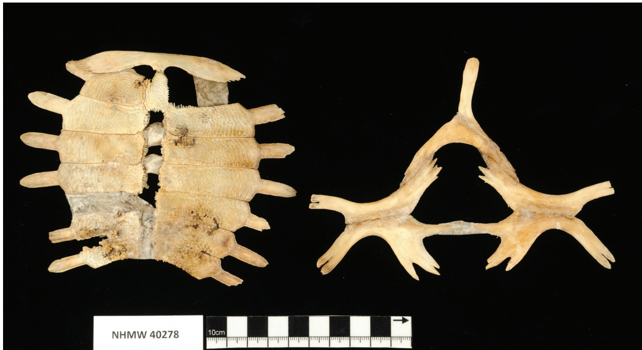
Figure 2. Holotype (NHMW 40287) of A. o. jongli ssp. nov. Bony elements of carapace (dorsal) and plastron (dorsal/visceral). Some neurals, 1 st pleural right, left epiplastron and xiphiplastron missing.