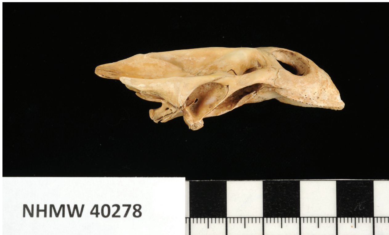
Figure 5. Holotype (NHMW 40287) of A. o. jongli ssp. nov. Skull in lateral view. Note the convex structure of frontal, prefrontal and maxillary.

on the back and missing “ocelli” on carapace similar to A. c. maculosa . It strongly resembles A. o. jongli ssp. nov. concerning faded dots and vermiculation on head and neck too, but was tentatively assigned to A. o. phayrei by Fritz et al. (2014) mainly on zoogeographical reasons. However, its identity remains doubtful.