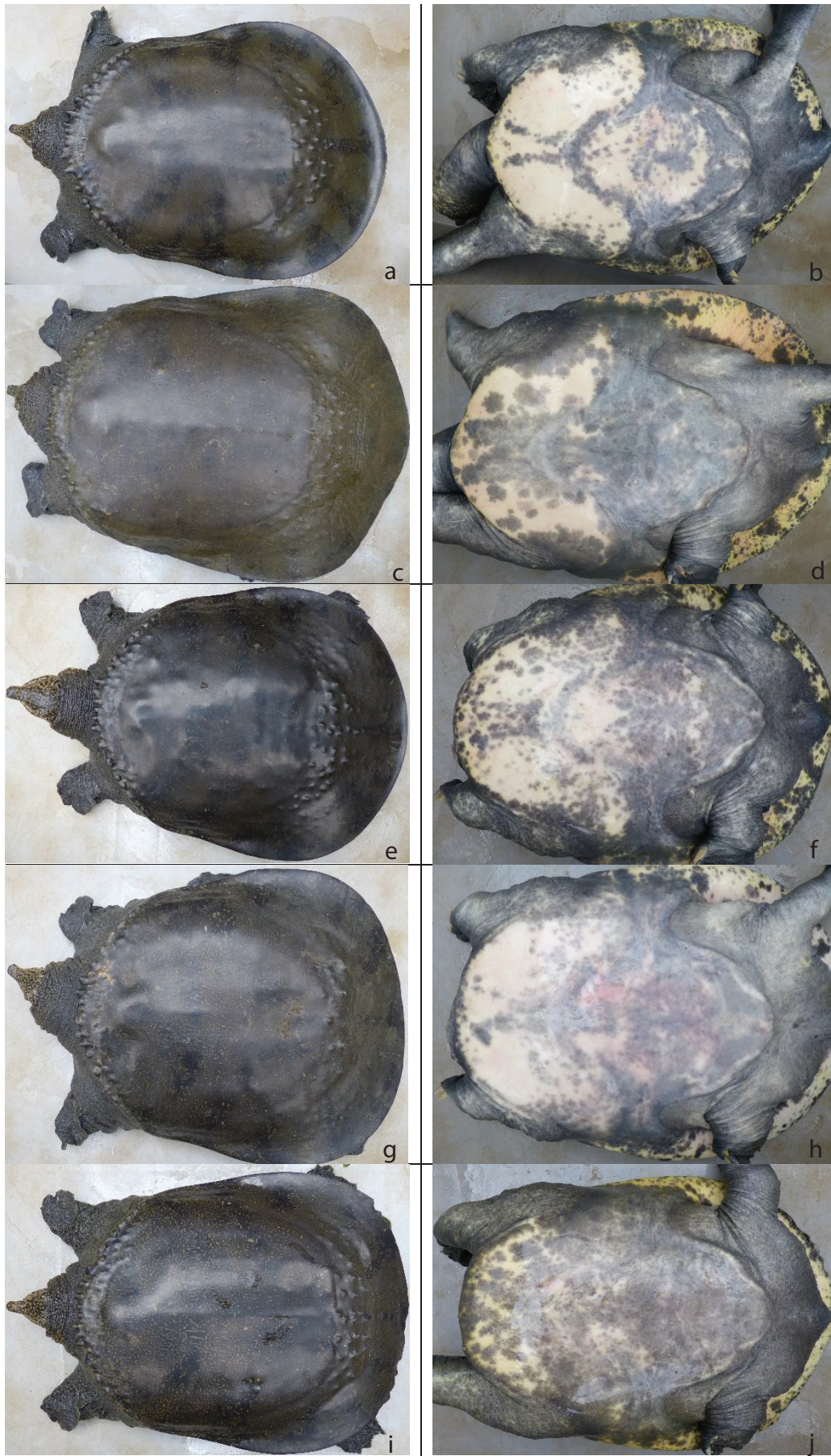
Figure 6. Paratypes, NHMW 41463:1 (a, b); NHMW 41463:2 (c, d); NHMW 41463:3 (e, f); NHMW 41463:4 (g, h); NHMW 41463:5 (i, j), living specimens of A. o. jongli ssp. nov. in the holdings of “Turtle Island”, dorsal and ventral view.