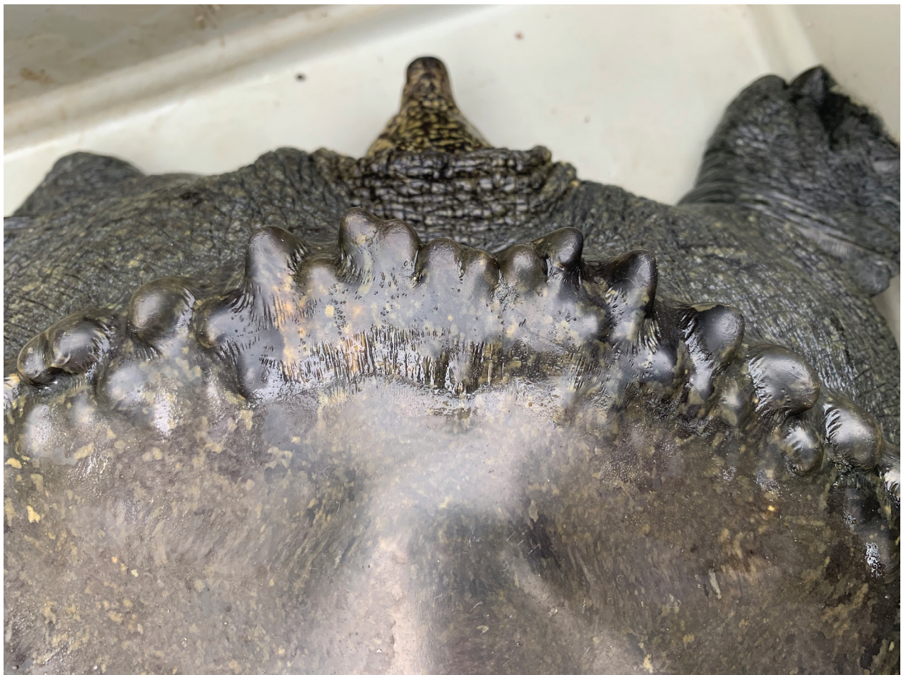
Figure 8. Tubercles are visible, protruding over the front of the carapace in the nuchal and back region in subadult and adult animals.

The Sangu River flows through Myanmar and Bangladesh, its source is in the North Arakan Hills of Myanmar and forms the boundary between Arakan and the Chittagong Hill Tracts. It follows a northerly circuitous course in the hill tracts and then enters Bangladesh near Remarki, Thanchi Upazila, Bandarban District, from the east. It flows north through Thanchi, Rowangchari and Bandarban Sadar Upazilas of Bandarban District. It then flows west through Satkania and Banshkali Upazilas in Chittagong District and flows into the Bay of Bengal near Chittagong, about 16 kilometres south of the mouth of the Karnaphuli River. Sangu drains off the waters of Patiya, Satkania, and Banshkali Upazilas and has a connection with the Karnaphuli River through the Chand Khali River. A. o. jongli ssp. nov. has not been recorded in the Karnaphuli River. The Sangu is a shallow river, but it becomes violent during rains and develops rapid currents. Thus, the Sangu River System, along with the Karnaphuli River, form a river system that is neither connected in the north to the Brahmaputra, nor in the south to the Irrawaddy River system.