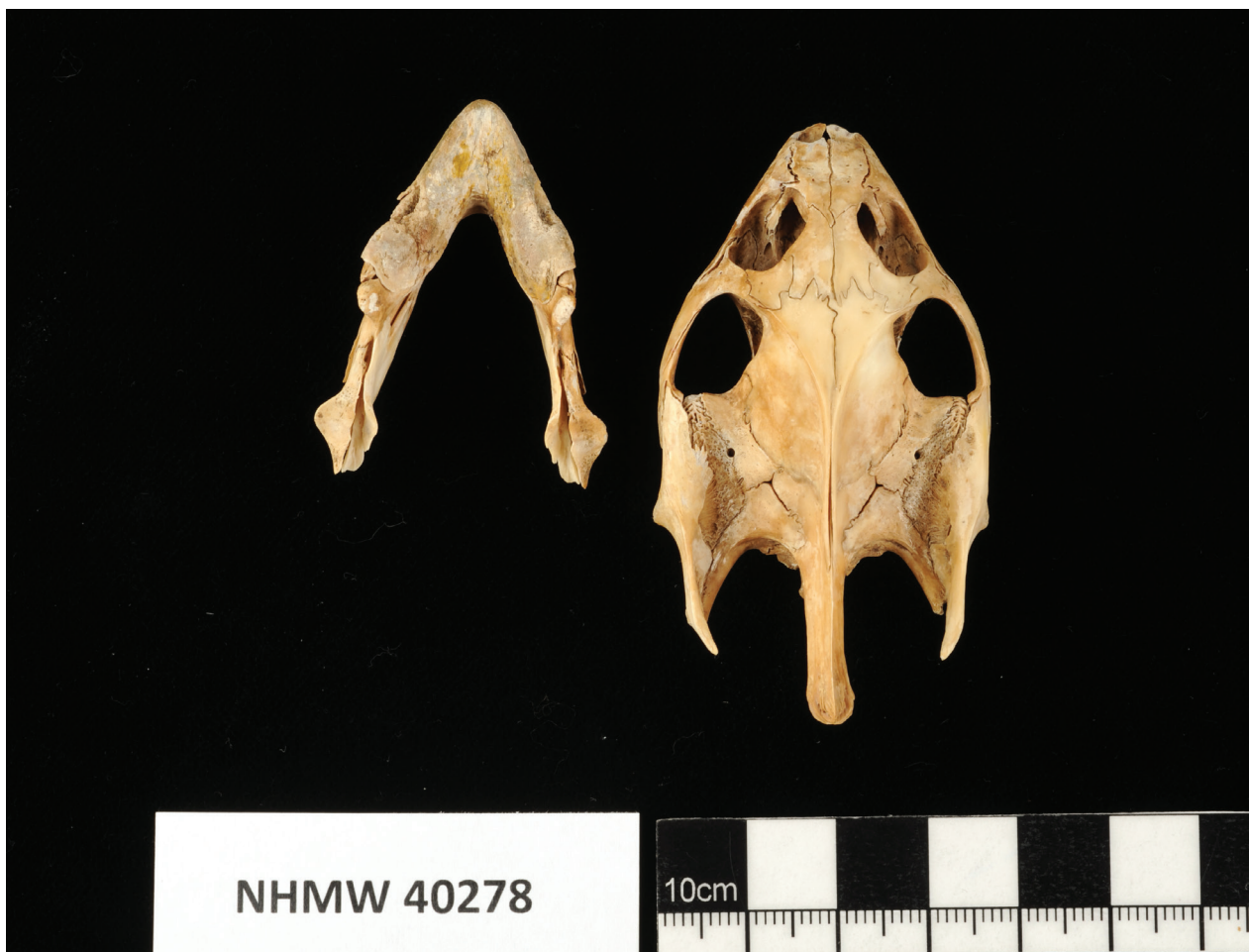
Figure 3. Holotype (NHMW 40287) of A. o. jongli ssp. nov. Lower jaw (dorsal with alveolar surface of mandible) and skull (dorsal).