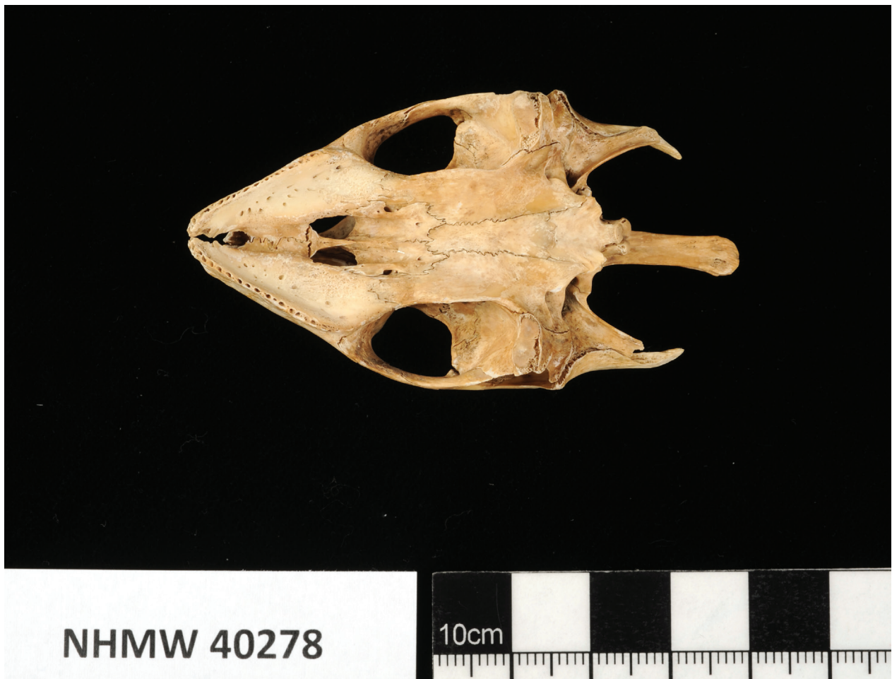
Figure 4. Holotype (NHMW 40287) of A. o. jongli ssp. nov. Skull in ventral view.

Amyda o. phayrei differs from the other two subspecies by its dull brown carapace, yellow pigments present forming distinct yellow dots on the head and neck; carapace with or without distinct saddle-shaped dark colouration; with eyes open, the eyelids have distinct yellow spots alternating with grey “zebra striped” colouration; tubercles in the nuchal and back region of the carapace but not as distinct as in A. o. jongli ssp. nov.; head in upper side view more slender and narrowed to the pro-